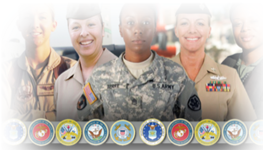
1 Women in the Military

We pay tribute to all Charlton Veterans, past & present and announce new name additions to the Charlton Veterans Board. This year's Memorial Day Ceremony theme is "Women in the Military".